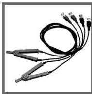
9140 FOUR-TERMINAL PROBE DC to 100 kHz