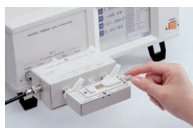
Example of connecting the 9262 and 9268 / 9269

The 9268 can be used for voltages up to a maximum of DC \pm 40 V. The 9269 can be used for currents up to a maximum of DC \pm 2 A.