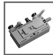
9263 SMD TEST FIXTURE DC to 5 MHz