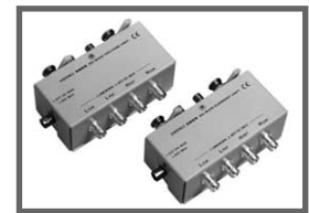
9268 DC BIAS VOLTAGE UNIT Maximum applied voltage: ±40 V DC 9269 DC BIAS CURRENT UNIT Maximum applied current: ±2 A DC