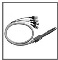
9143 PINCHER PROBE DC to 5 MHz