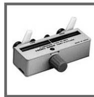
9262 TEST FIXTURE DC to 5 MHz