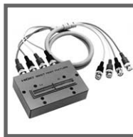
9261 TEST FIXTURE DC to 5 MHz